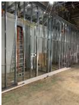
Client Meeting Rooms