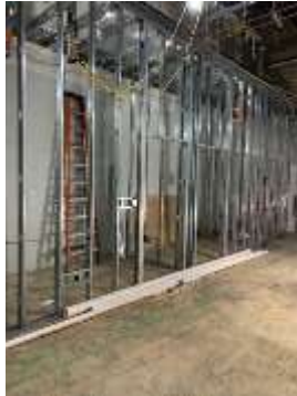
Client Meeting Rooms